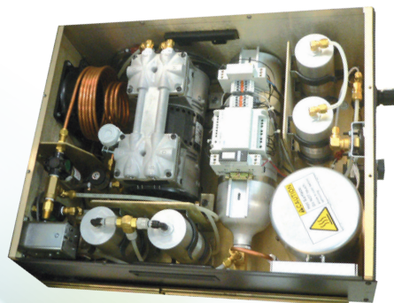
ZAG7001 - internal view