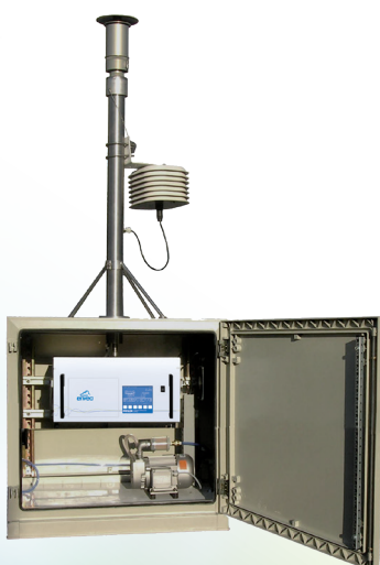
Example: wall-mounted version of the sampler, installed in a fixed, outdoor station