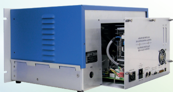
Sliding drawer on the rear panel for easy access and maintenance