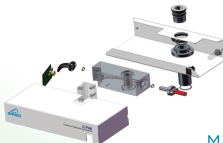
Optical CPM light scattering module for evaluation in real time of several particulate size fractions