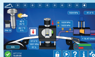
TCP/IP remote ESA Connect™ interface with animated diagram and intuitive navigation